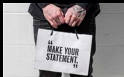
PAPER BAG SET (1=10)