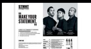
STMNT SALES PAGER