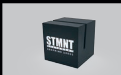
2X CARD HOLDER (SET)