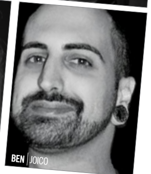
BEN | JOICO

To purchase tickets: 1.800.455.6426 or 204.786.0001 ext 224