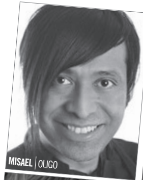
MISAEL | OLIGO