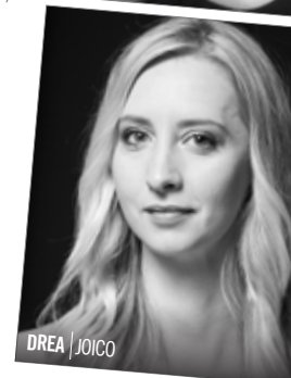
DREA | JOICO