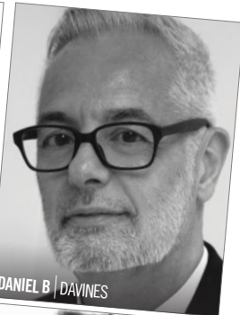
DANIEL B | DAVINES